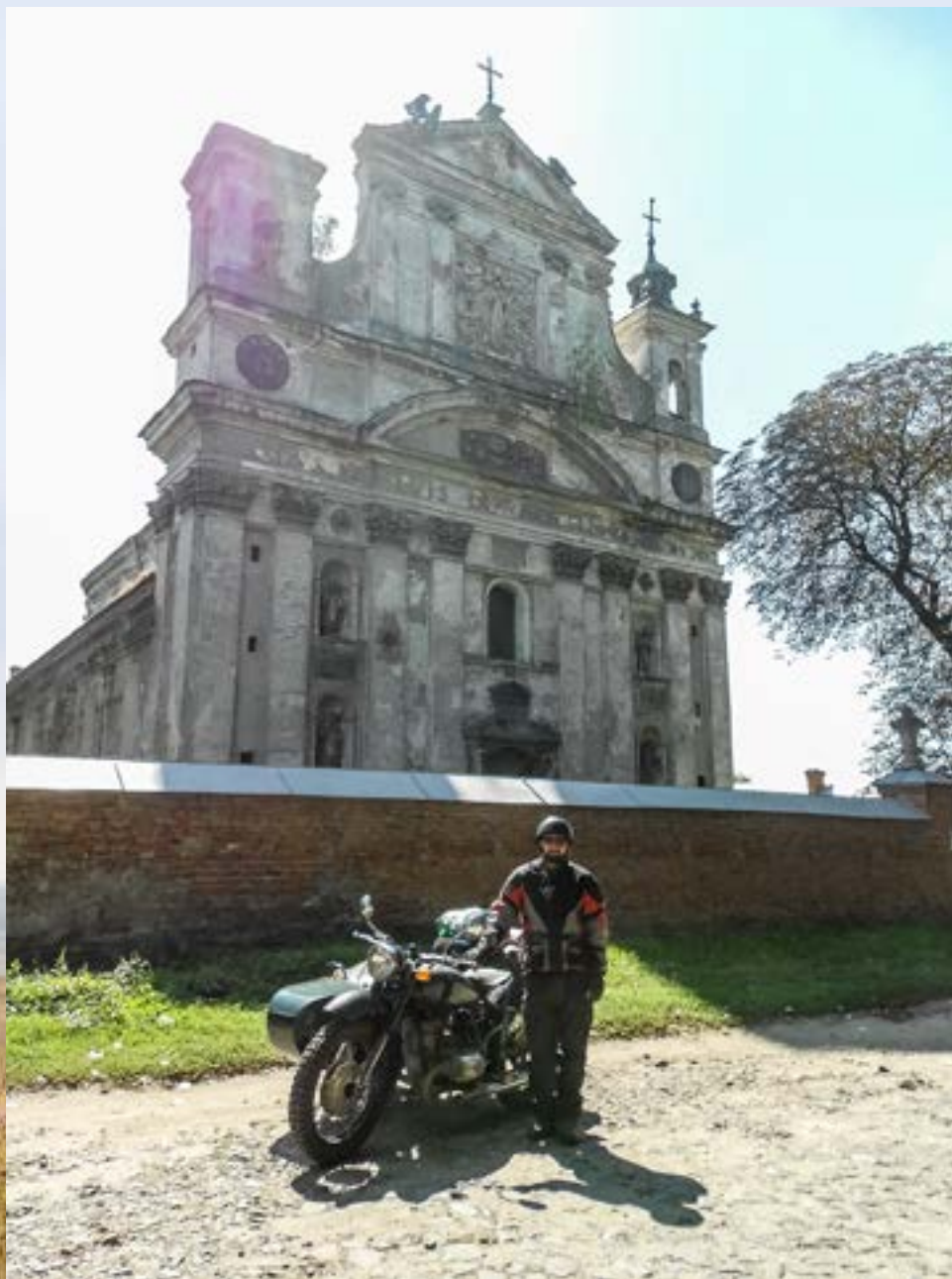
Near Roman Catholic Cathedral in Olyka town in the region of Volyn