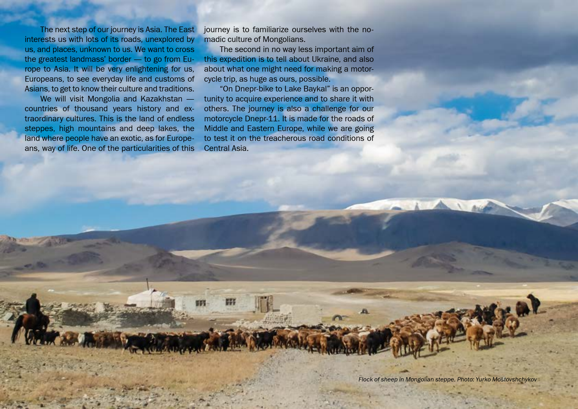
Flock of sheep in Mongolian steppe.

“On Dnepr-bike to Lake Baykal” is an opportunity to acquire experience and to share it with others. The journey is also a challenge for our motorcycle Dnepr-11. It is made for the roads of Middle and Eastern Europe, while we are going to test it on the treacherous road conditions of Central Asia.