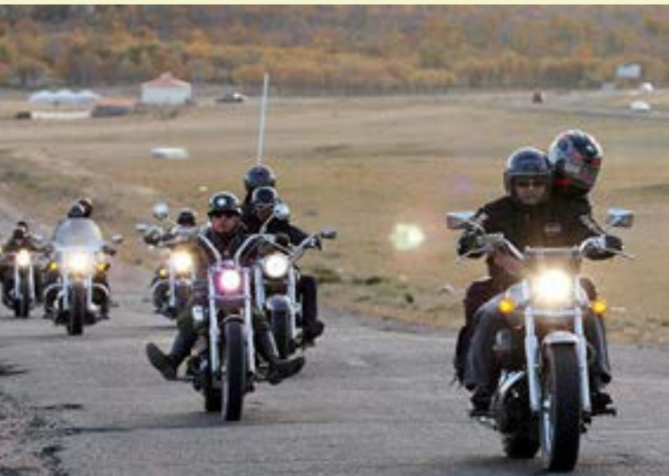
Ulan-Bator bikers.