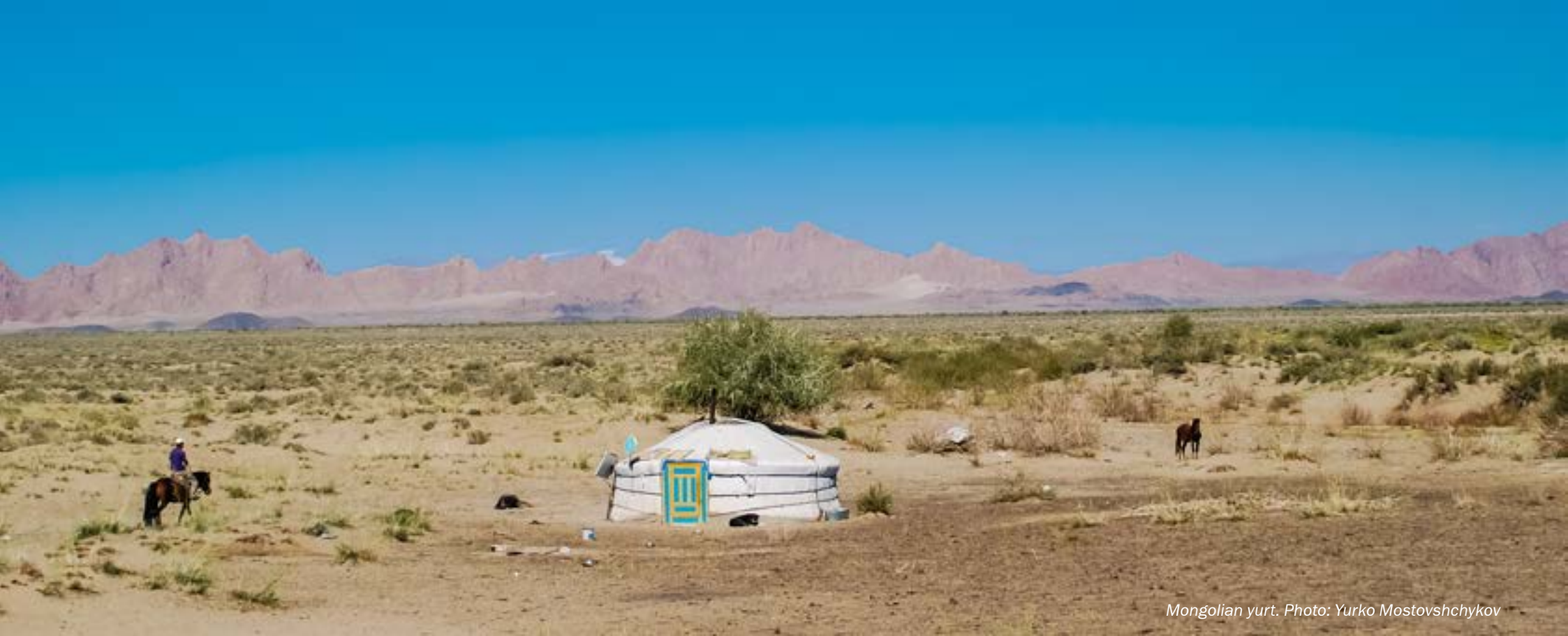
Mongolian yurt.