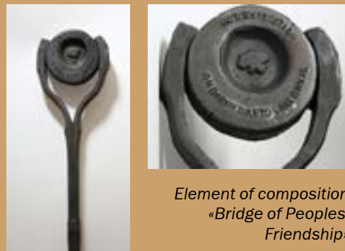
Element of composition «Bridge of Peoples' Friendship»